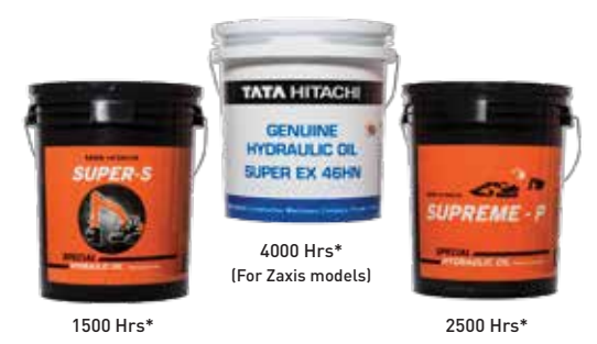
Hydro-cracked base oil created by advanced refining technology Excellent wear resistance by Zinc-free additives.

* Drain intervals may vary based on application & site conditions